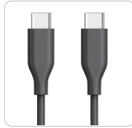
USB-C to USB Type-A Cable