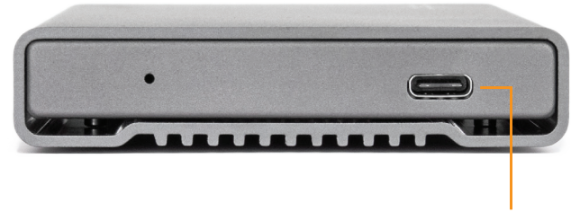
USB 3.1 Gen 2 Type-C 10Gb/s