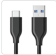
USB-C to USB-C Cable