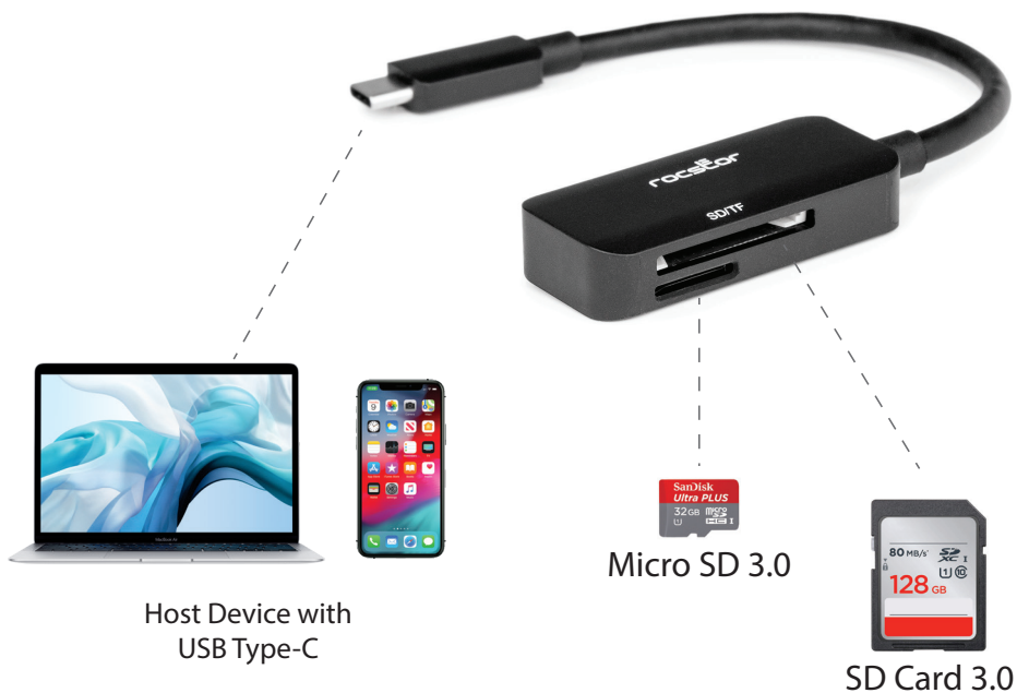
Host Device with USB Type-C